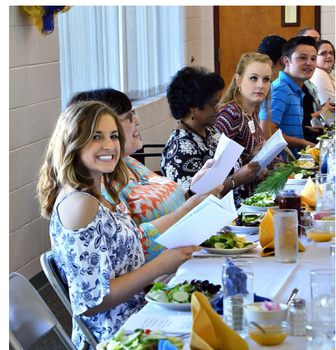
Students and donors were able to meet at the annual Scholarship Luncheon.