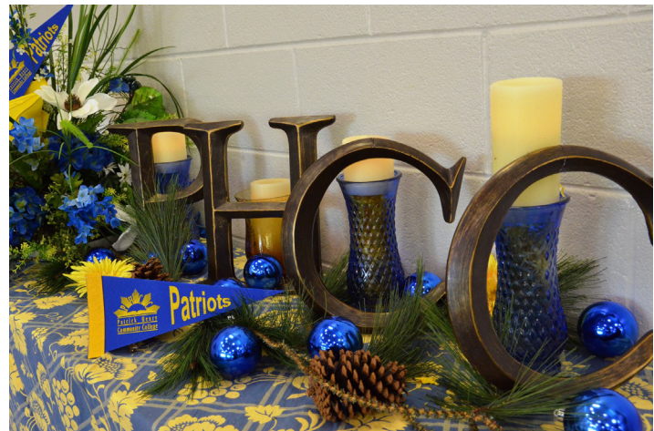
Luncheon decorations by Renee Hodges