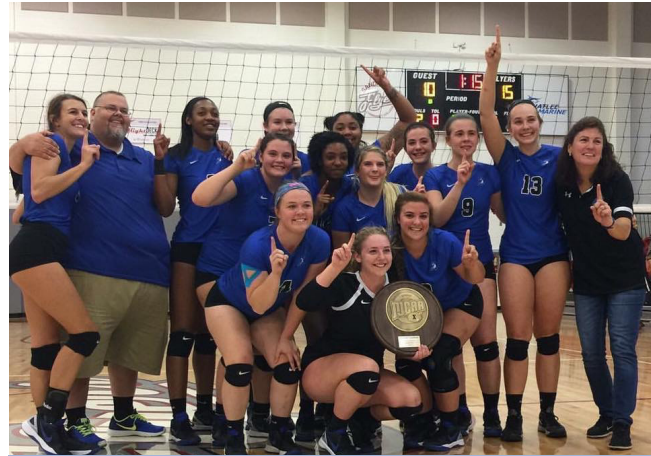
PHCC Volleyball Team Region X Champions!